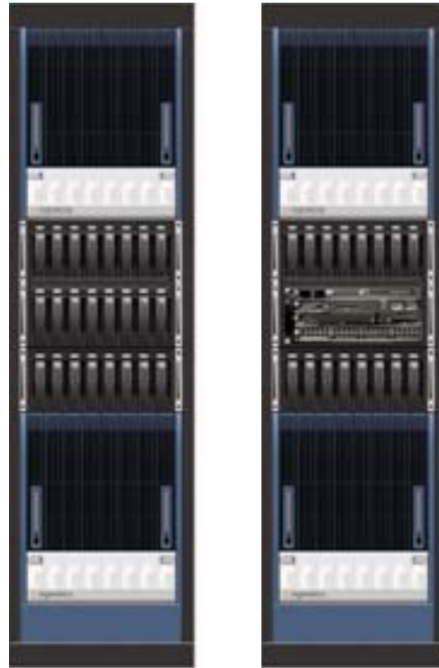
The BladeFrame ES chassis was designed for mounting in an industry-standard rack along with external storage devices and/or networking equipment such as hubs, routers and switches.

Recognizing that BladeFrame ES is often deployed at remote sites without access to IT professionals, Egenera designed the system for serviceability and remote management. Most blade components are easily customer-replaceable. What's more, the system features event-notification functionality and can be monitored by Egenera on a 24x365 basis for proactive support. Likewise, customers can remotely monitor BladeFrame ES status from a central operations center.