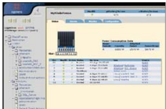
Egenera PAN Manager software provides a single point for configuring, managing and monitoring both the physical and virtual resources in the Processing Area Network.